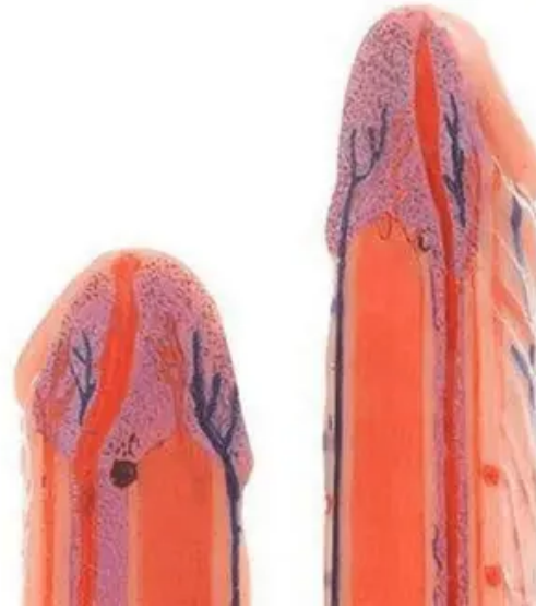
Sex For More Than 3 Hours Without Viagra! Write Down The Recipe

Harvey's face darkened before he let out a huge sigh.