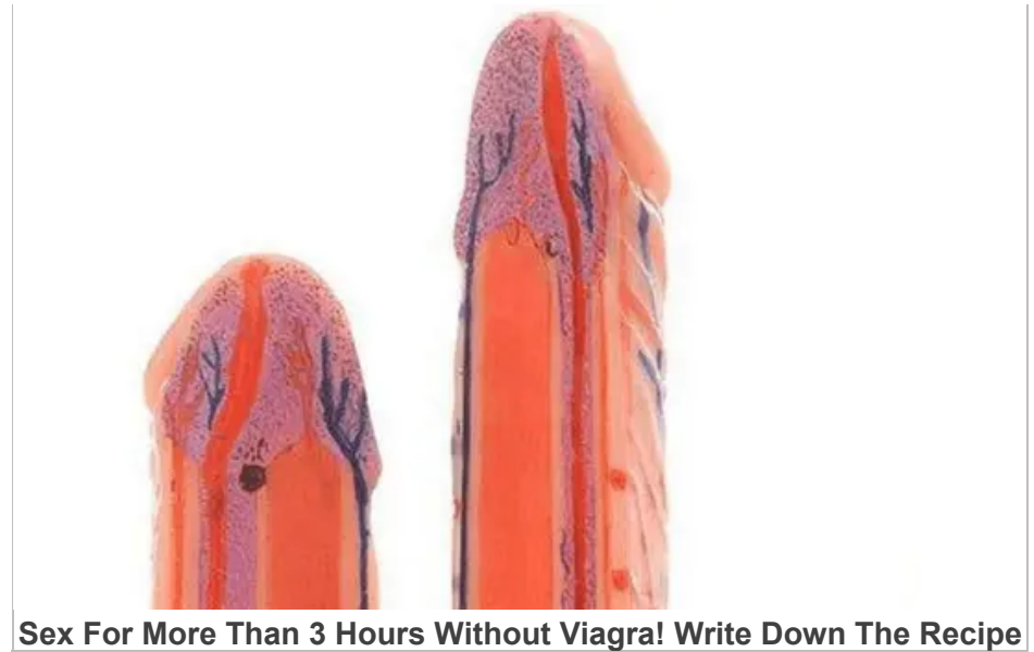
Sex For More Than 3 Hours Without Viagra! Write Down The Recipe