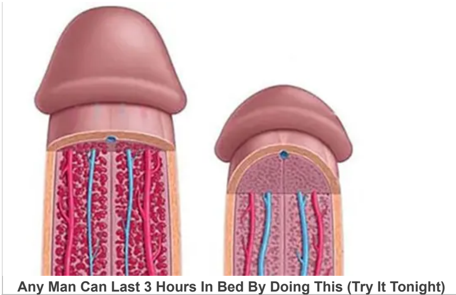
Any Man Can Last 3 Hours In Bed By Doing This (Try It Tonight)